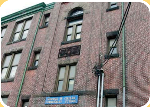
Childs Elementary School at 17th and Tasker Streets.

The disposition of these properties will take place under the guidelines spelled out in the Adaptive Sale and Reuse Policy which the SRC adopted at its June 13, 2011 meeting. These steps include a public request for proposals from interested purchasers, informational community meetings, and a community presence on the District committee that will review and evaluate the proposals. The District seeks to receive proposals that span three uses specified in the policy: educational, community or public use, or private use.