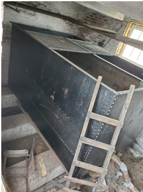
Tank Room (Passage Area) Photo #3

Doghhouse: located in the southern corner of the play space. This area is to be demolished per drawing SD-102.0 down to the level of the play space. This area is approximately 110 square feet. The space has approximate dimensions of 15.5-feet by 9-feet by 5.5-feet in height. The GC is responsible to verify all dimensions in the field. The GC is responsible for verifying if existing MEP/FP systems are active and take the appropriate measures to coordinate with the School District to temporarily deactivate systems as required to perform the structural work.