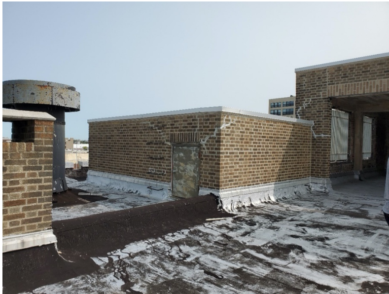
Tank Room (Passage Area) Photo #1

The following photos provided are representative of the existing MEP/FP systems in the Tank Room (Passage Area):