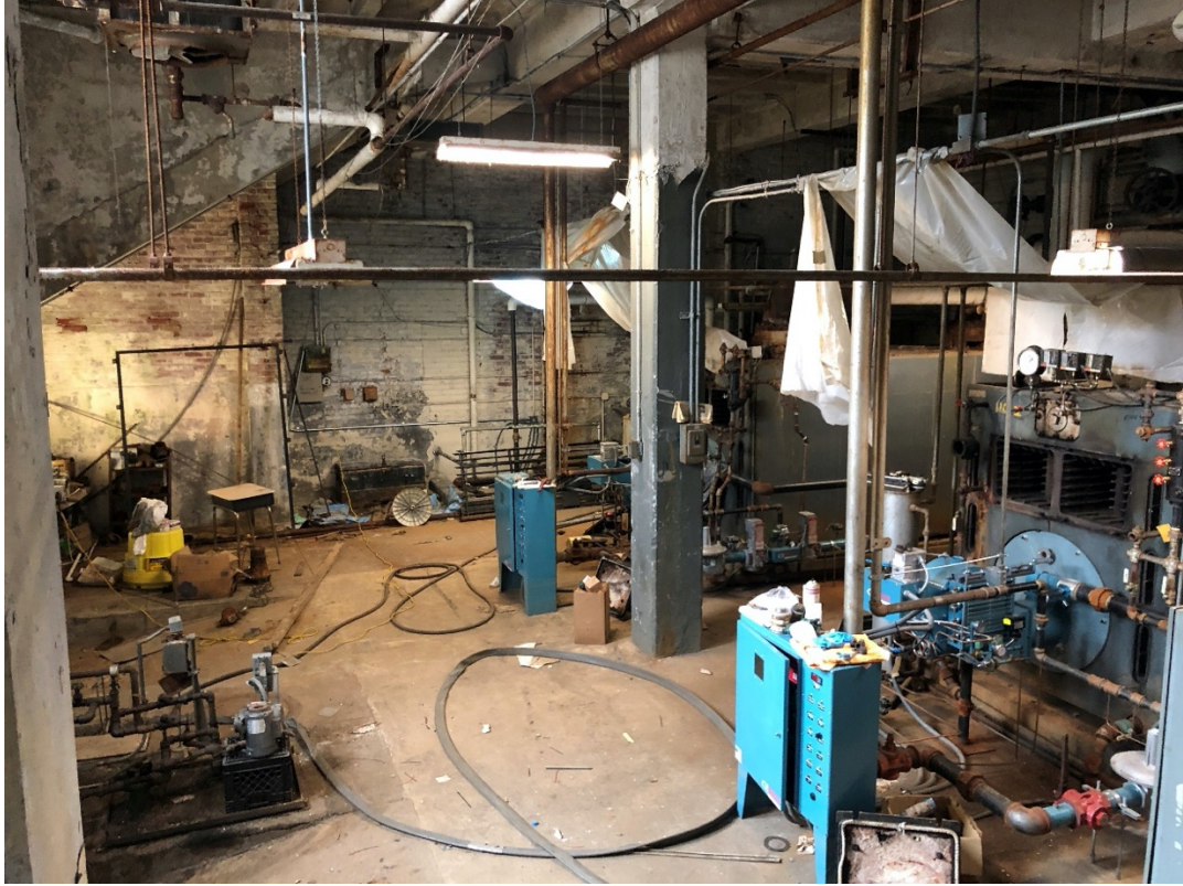
Boiler Room Photo #2