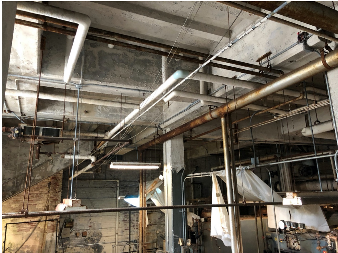
Boiler Room Photo #1

The following photos provided are representative of the existing MEP/FP systems in the Boiler Room: