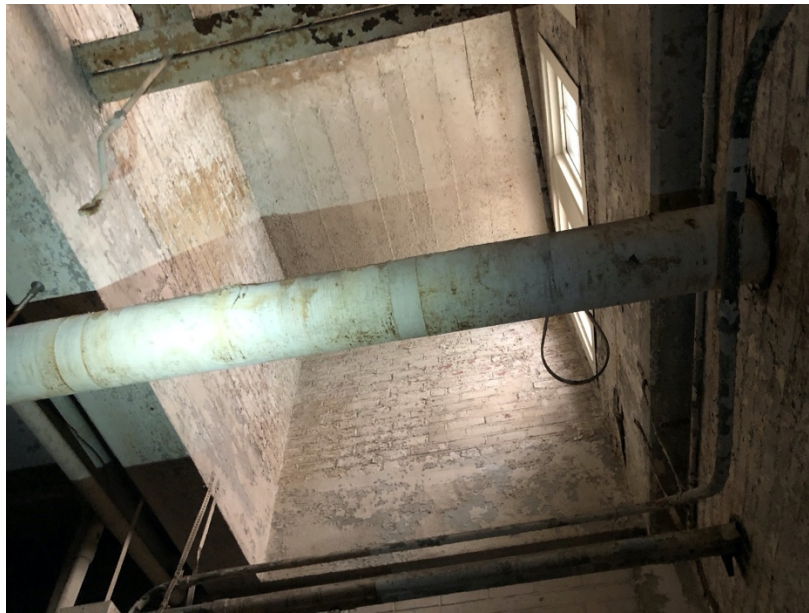
Doghouse Photo #2

Boiler Room and Fresh Air Room: Located below the play space. This area is to have structural repair and replacement per SD-102.0. This area is approximately 1,520 square feet. The space has approximate dimensions of 45-feet by 46-feet by