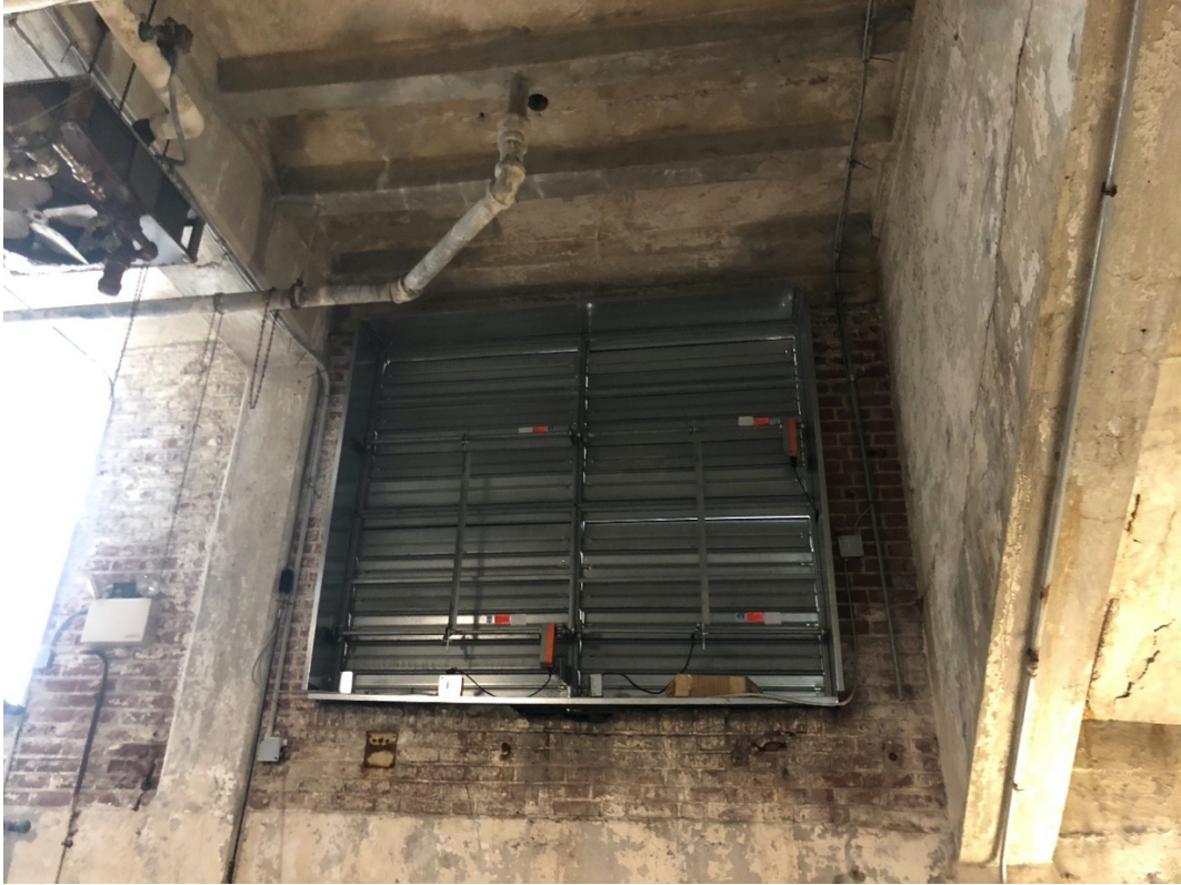
Boiler Room Photo #6

Coal and Ash Storage: Located below the play space east of the boiler room. This area is to have structural repair and replacement per SD-101.0. This area is approximately 1,180 square feet. The space has approximate dimensions of 46-feet by 25-feet by 10-feet in height. The GC is responsible to verify all dimensions in the field. The GC is responsible for verifying if existing MEP/FP systems are active and take the appropriate measures to coordinate with the School District to temporarily deactivate systems as required to perform the structural work.