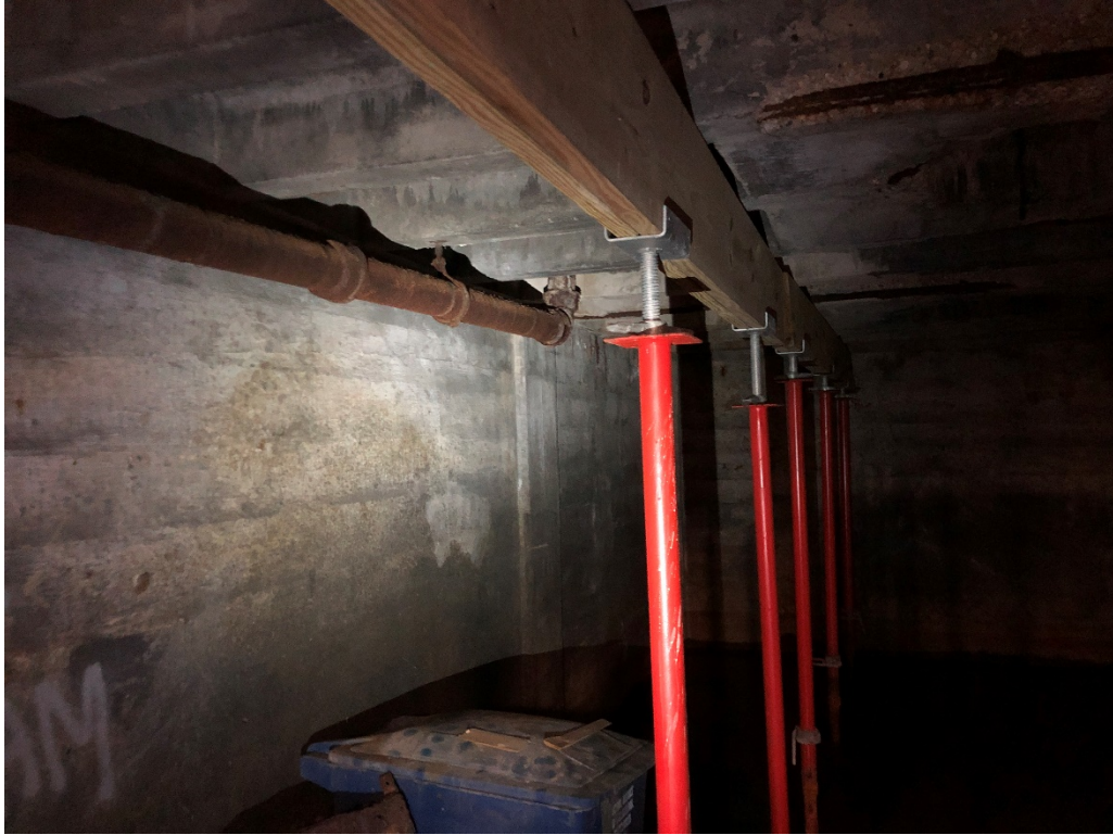
Coal and Ash Storage Photo #3