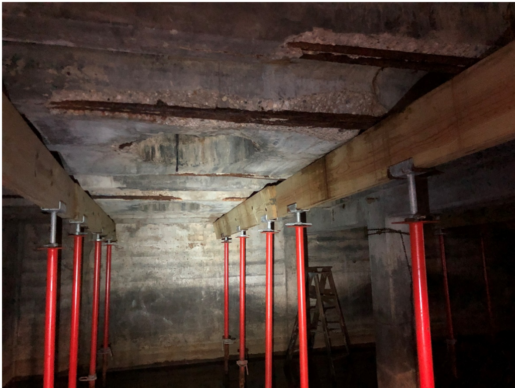
Coal and Ash Storage Photo #2