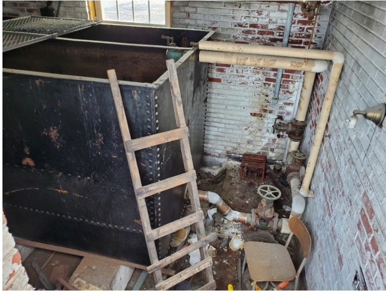
Tank Room (Passage Area) Photo #2