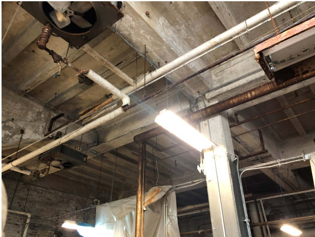
Boiler Room Photo #3