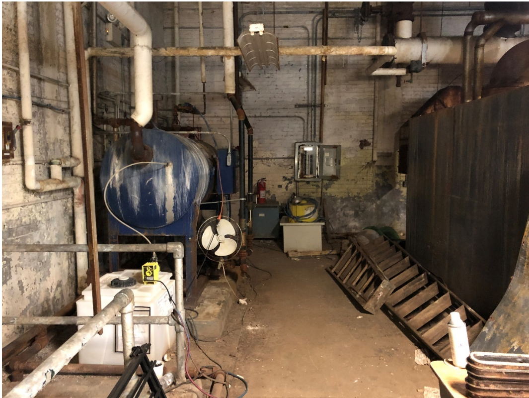
Boiler Room Photo #5