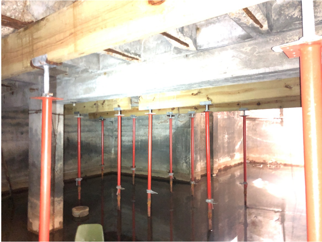
Coal and Ash Storage Photo #1