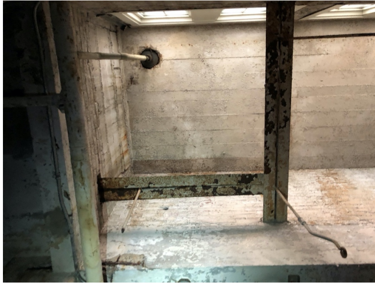
Doghouse Photo #1