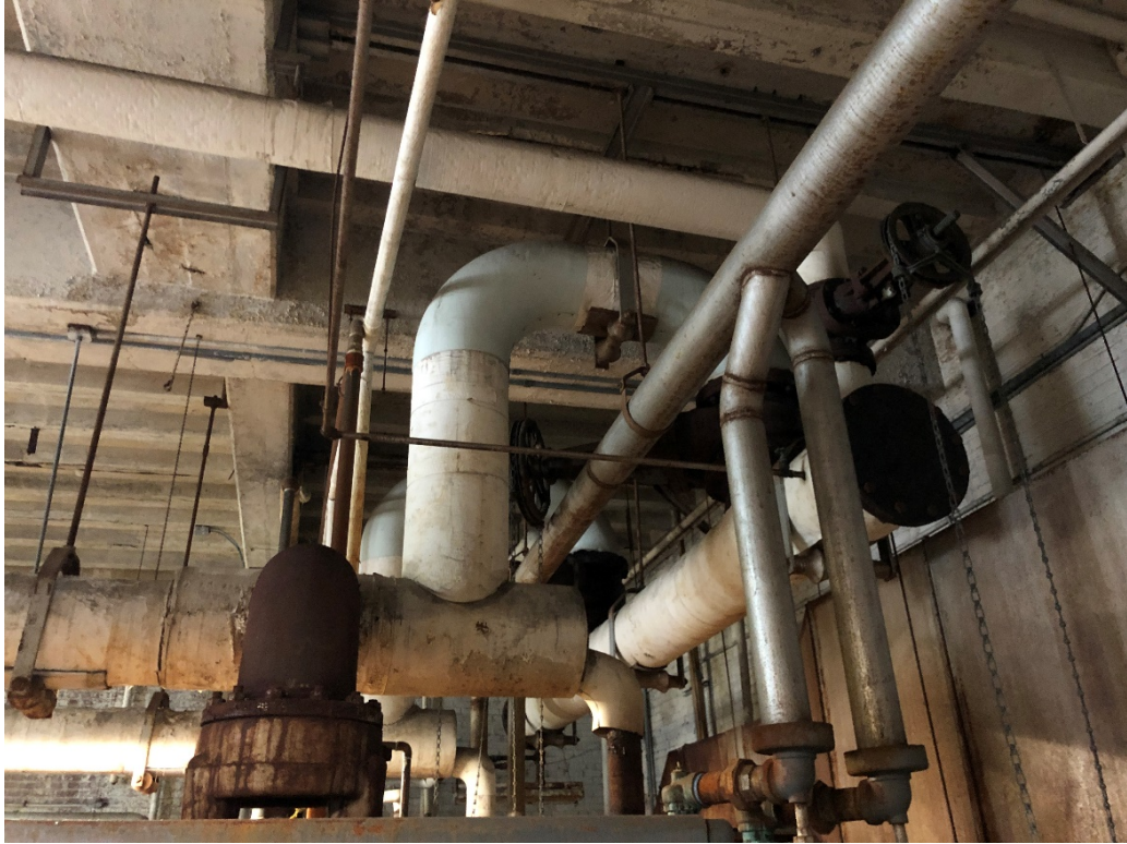
Boiler Room Photo #4