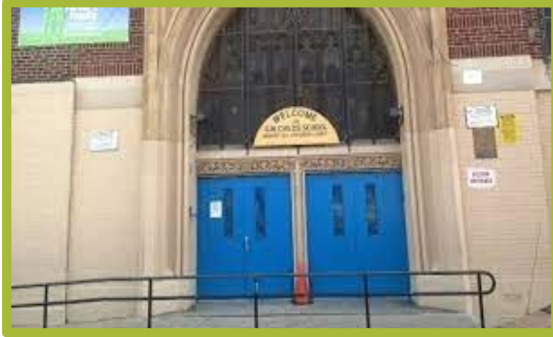
Barratt Childs Elementary School 1599 Wharton Street Philadelphia, Pennsylvania