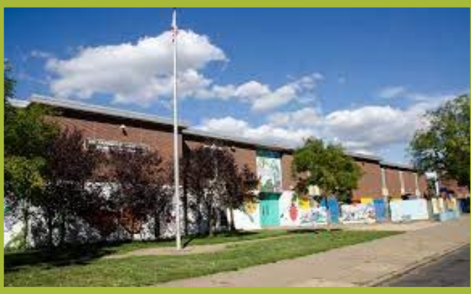
Tanner Duckrey School 1501 West Diamond Street Philadelphia, Pennsylvania