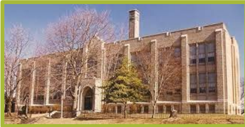
Comly Elementary School 1001 Byberry Road Philadelphia, Pennsylvania