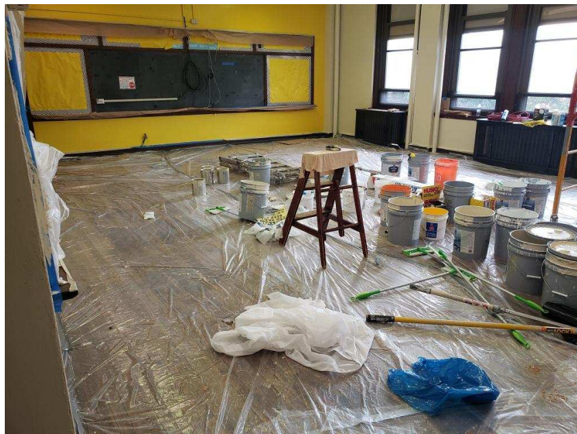
Photograph 7 – Typical classroom prepped during painting.