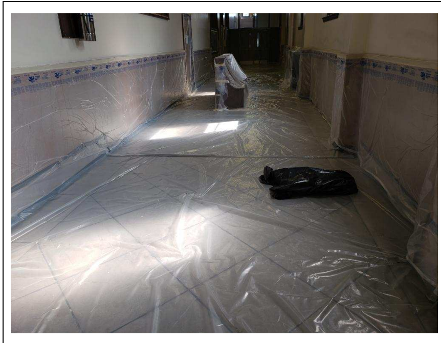
Photograph 9 – Typical hallway prepped for stabilization.