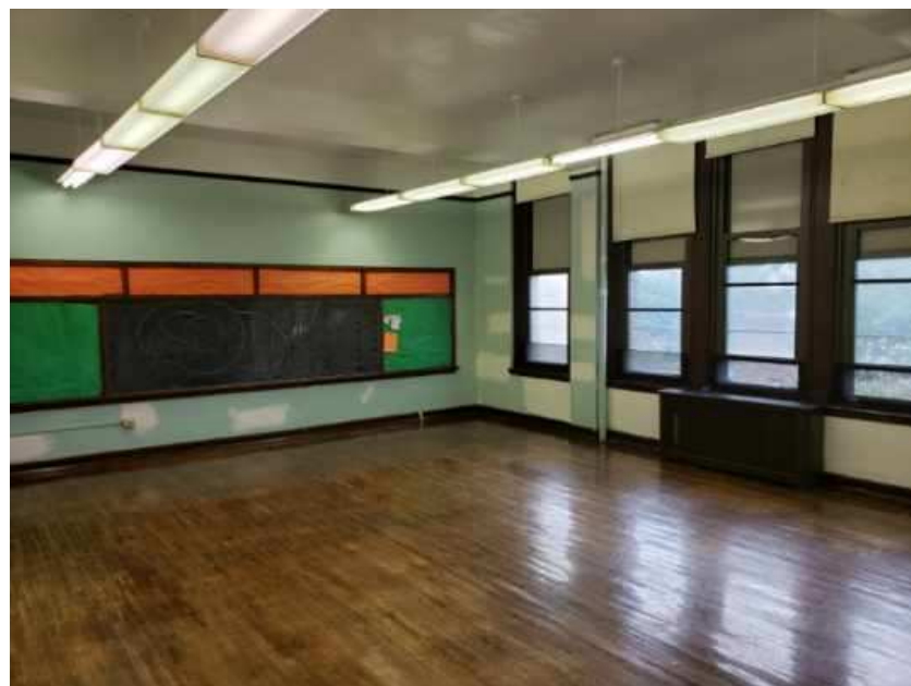
Photograph 1 – Typical classroom after stabilization but prior to painting.