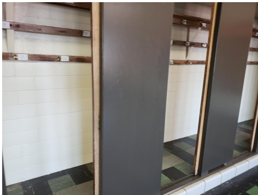
Photograph 8 – Typical closet after stabilization and painting.