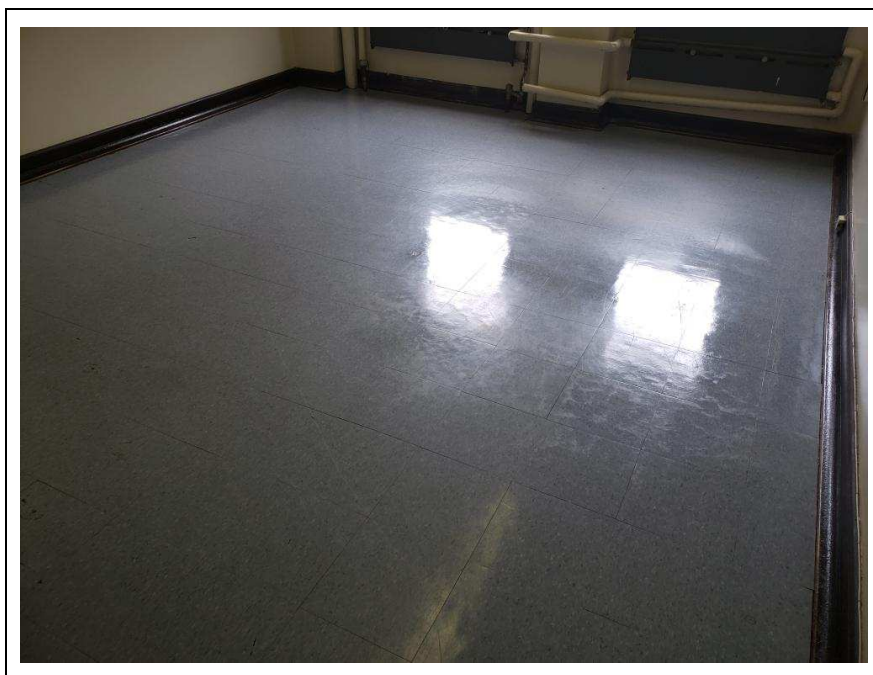
Photograph 10 – Typical office after stabilization and painting.