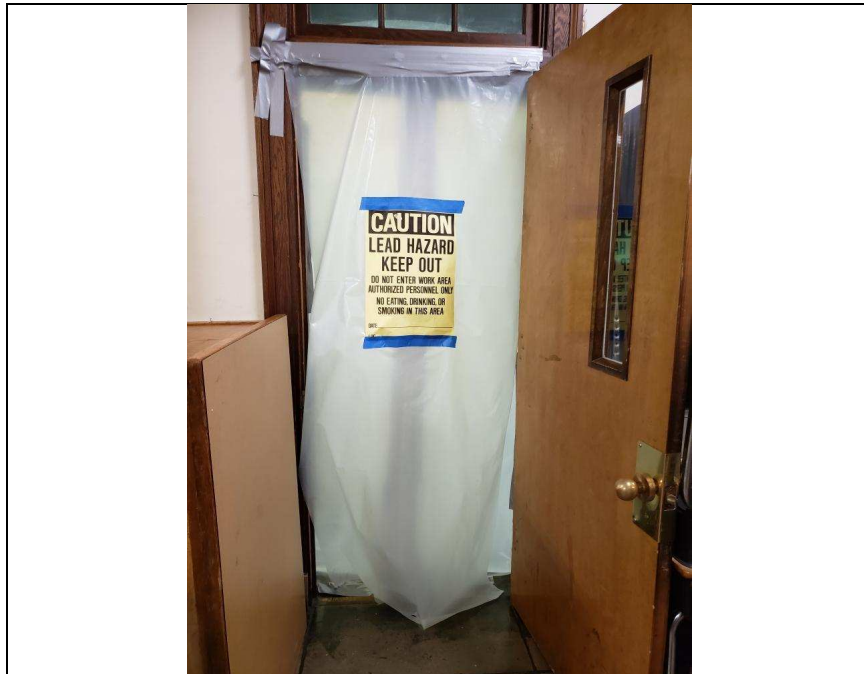
Photograph 3 – Warning sign at entrance to work area.