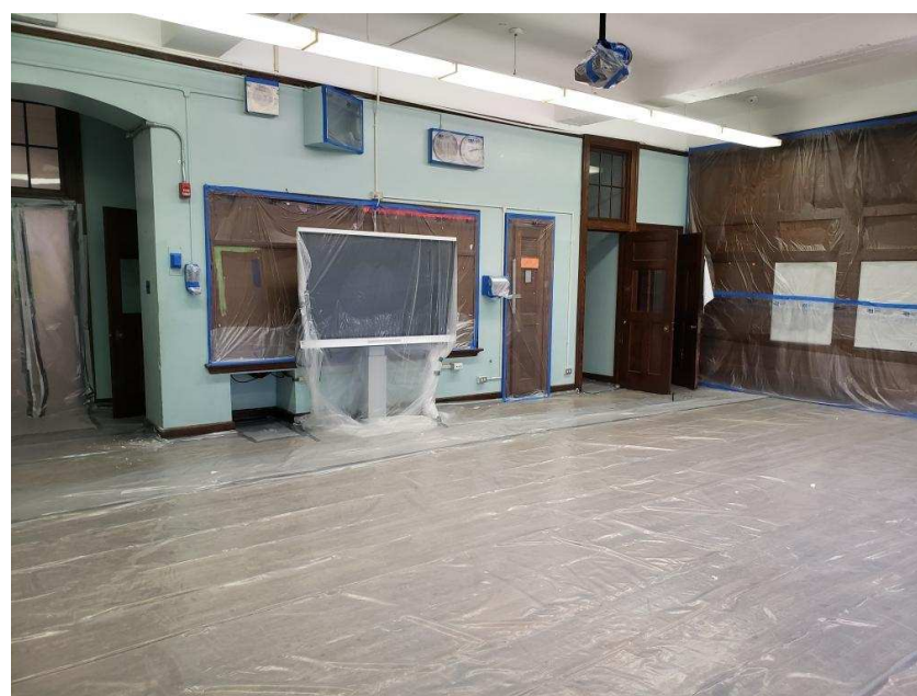
Photograph 2 – Typical classroom prepped for stabilization.