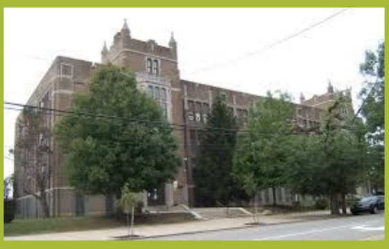
Carnell Elementary School 1100 Devereaux Avenue Philadelphia, Pennsylvania