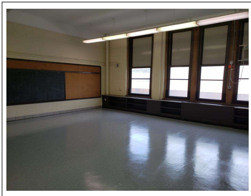
Photograph 4 – Typical classroom after stabilization and painting.