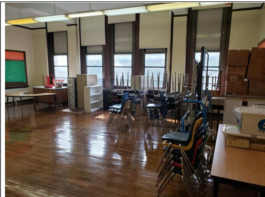
Photograph 5 – Typical classroom after stabilization and painting with contents back in.