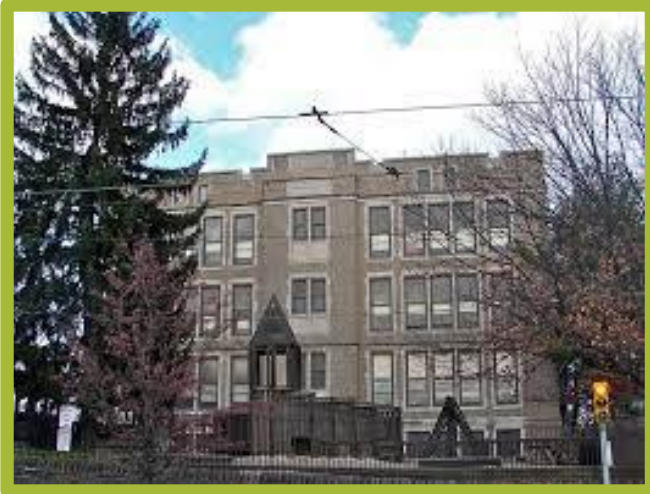
J.S. Jenks Academy for Arts and Science 8301 Germantown Avenue Philadelphia, Pennsylvania