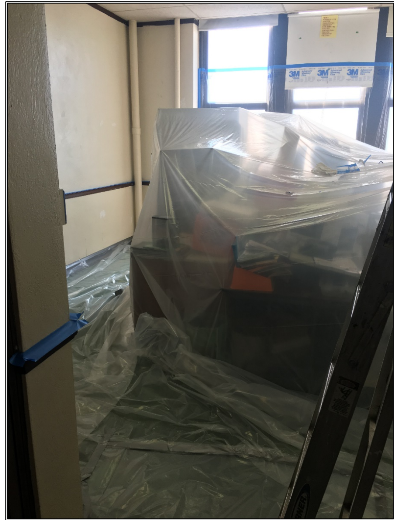
Photos 1 & 2 Typical Contained Classroom Prior to Renovation