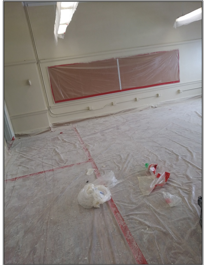
Photos 3 & 4 Typical Contained Classroom During Renovation