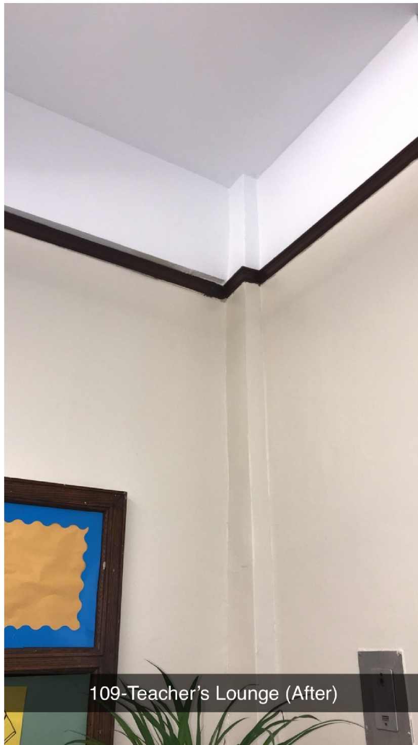
109-Teacher's Lounge (After)