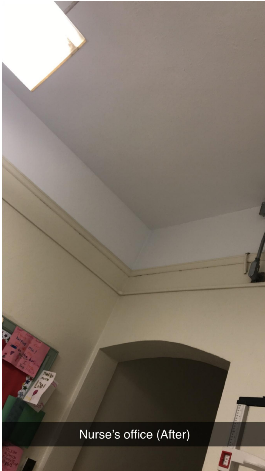
Nurse's office (After)