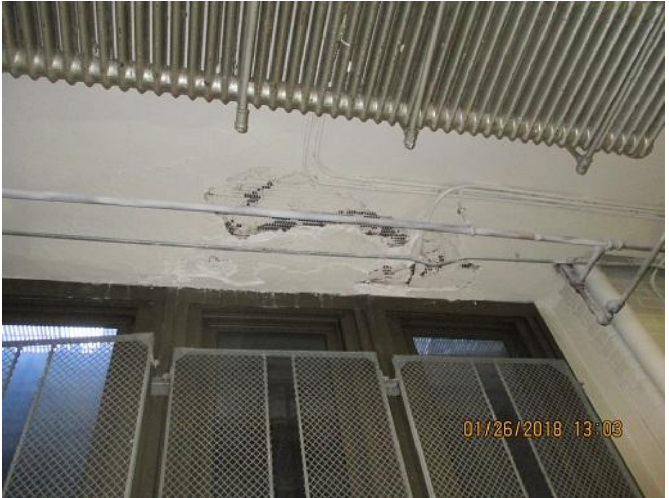
Prior to stabilization.