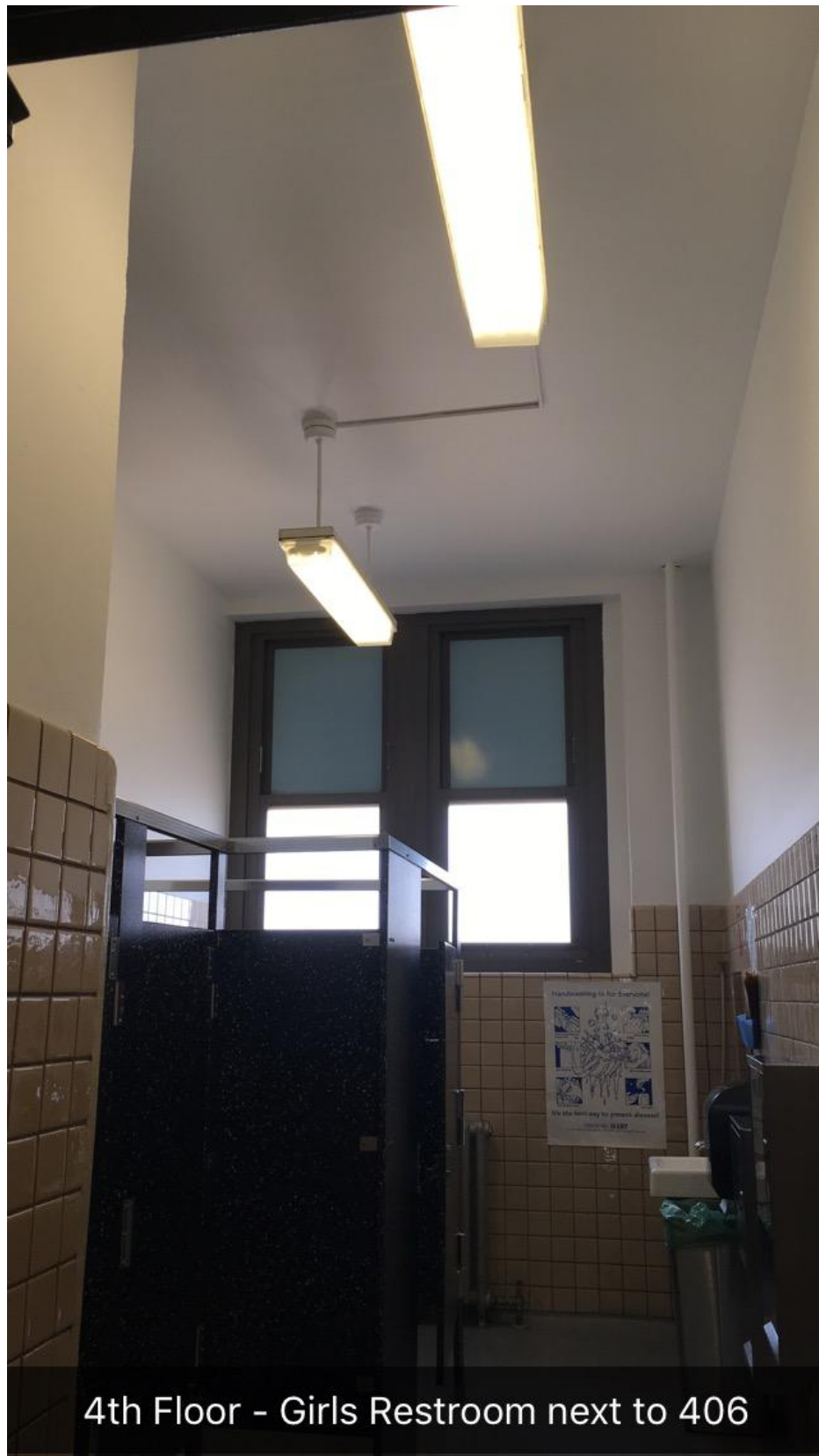
4th Floor - Girls Restroom next to 406