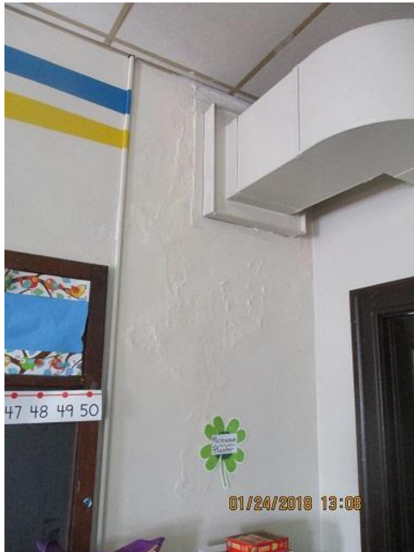
Prior to stabilization.