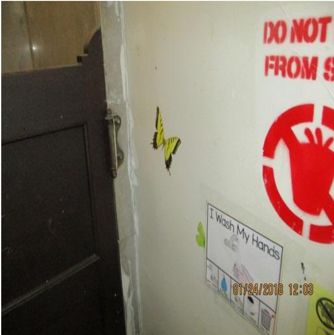
Prior to stabilization.