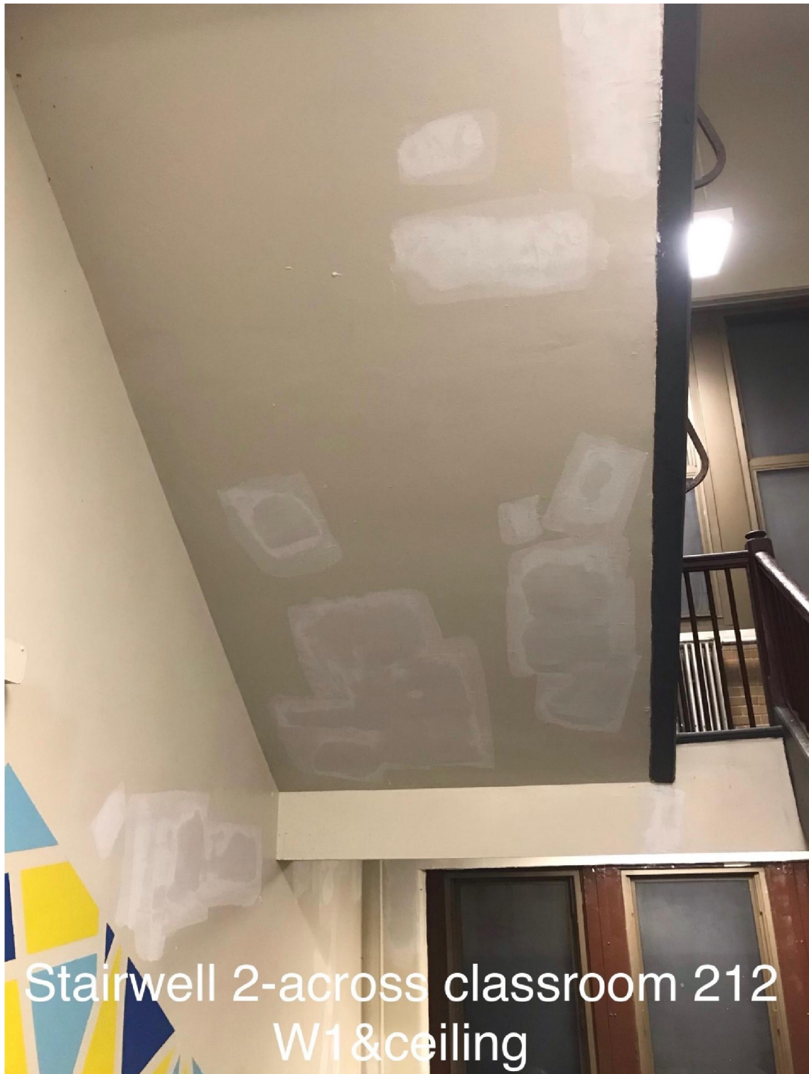
Post Stabilization but before painting