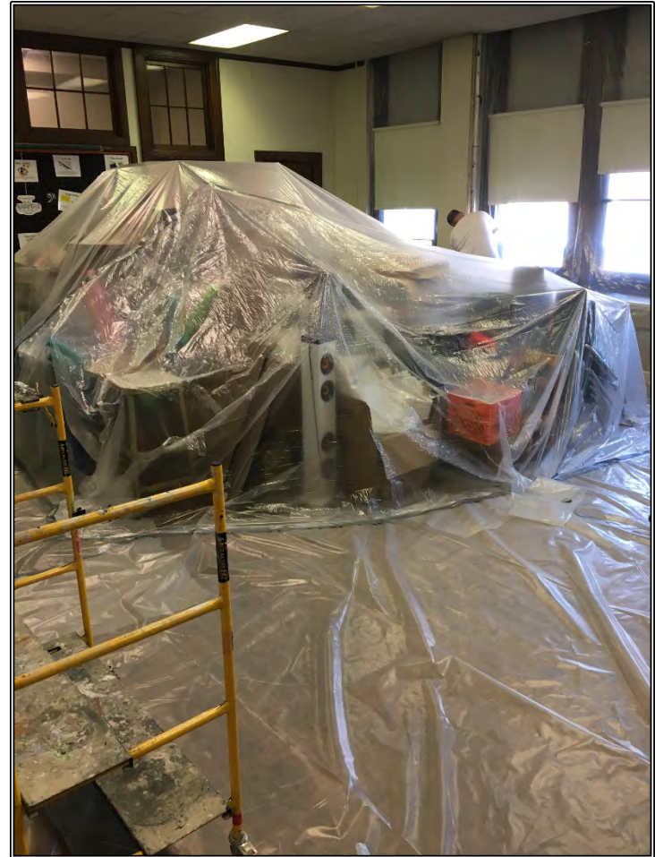
Photos 3 & 4 Engineering Controls being Prepared