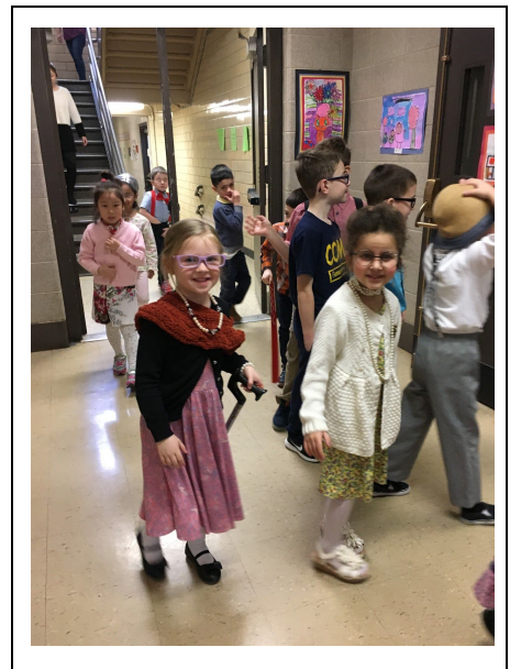
Kindergarten Celebrates the 100th Day of School