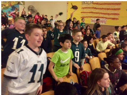
Eagles Pep Rally!

It is available in several languages. You will need your child's ID number to take the survey. If you have more than one child, we ask that you take it for each child at Comly. Your input helps with our planning for next year. The participation rate counts towards our School Progress Report. Thank you!