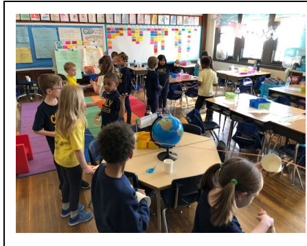
1st Grade Science

School starts promptly at 8:25AM daily. Please have your child to school on time, every day! Our current attendance rate is 94.4%