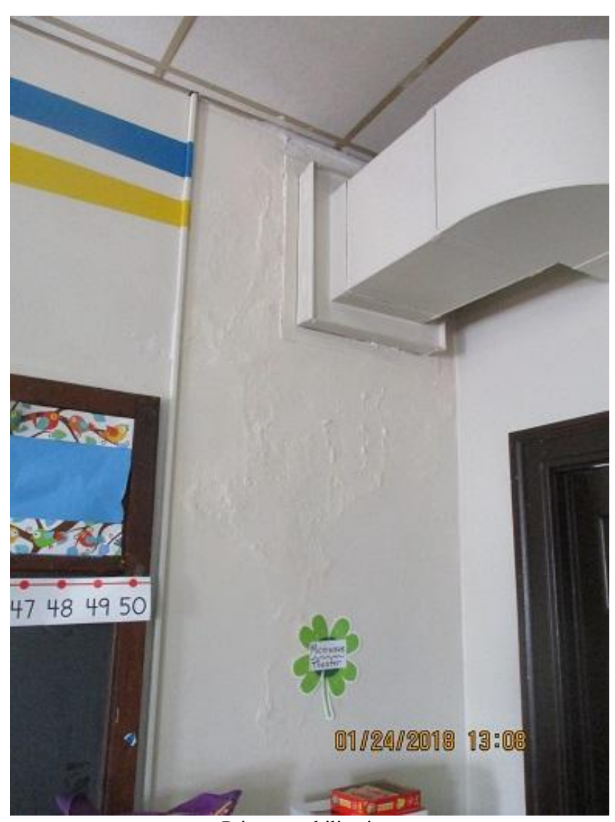
Prior to stabilization.