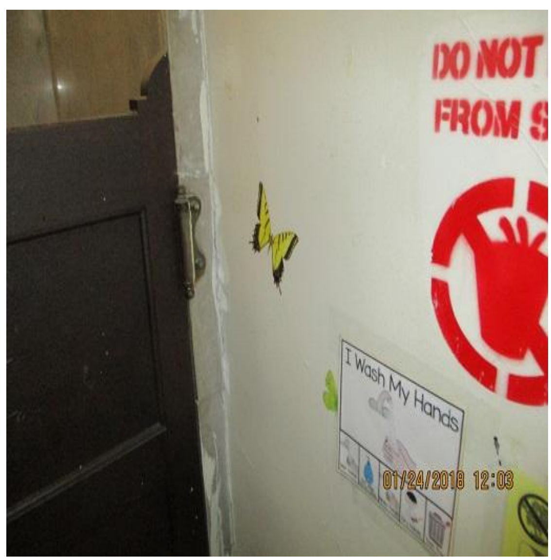
Prior to stabilization.