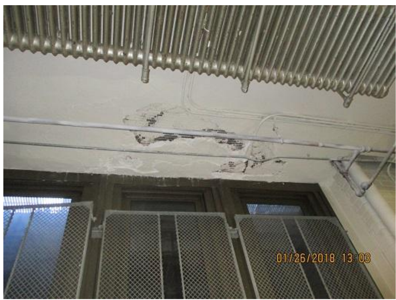
Prior to stabilization.