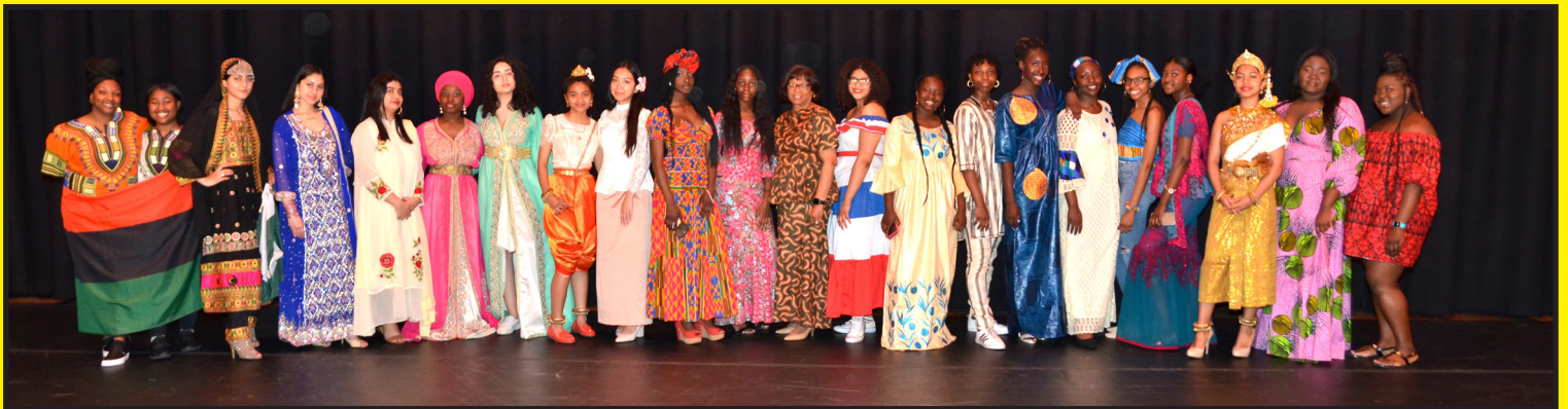
International Day Performers

Travel opportunities at Girls' High: Holland, China, Costa Rico, Cuba, Germany, Puerto Rico, and Spain