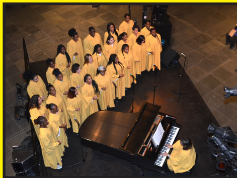
Honors Choir performing at the Kimmel Center

Art I to AP/IB Art, Dance, Orchestra, Vo- cal and the Lyra Society Harp Program