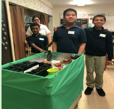
Wake Up with Greenberg, school breakfast program, teaches students business skills.