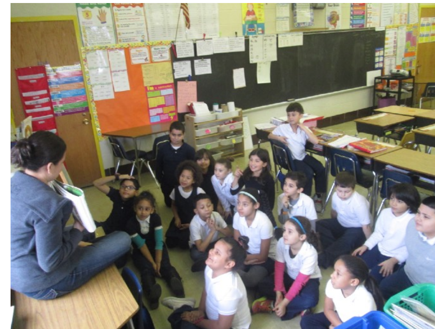
Second Grade Students listen attentively during story time.

"...once you walk through the doors, you easily see the passion and commitment of the educators and staff. This was surprising, refreshing and inspiring."~PhillyVoice