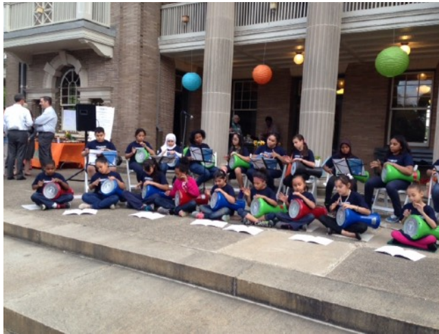
Moffet Drummers Public Performance at Smith Playground

2015 Certificate of Recognition: John Moffet was Recognized as 1 of the Top 70 Schools in the District or the Development of Their Response to Instruction