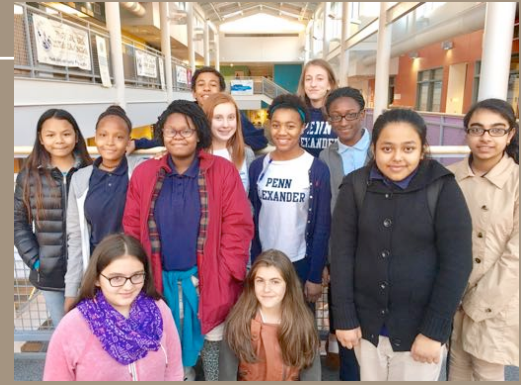
Lea and PAS 2016-17 Student Councils

Accomplishments of the council this year include collaborating with the Lea School Student Council; completing the first Change for Change campaign at PAS, which raised $2,000 for holiday gifts for families in the community; organizing the middle school dance with the theme Neon Lights; reviewing and revising the school uniform policy; and working on the online middle school Google classroom.