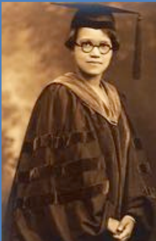
Sadie Tanner Mossell Alexander

Maximize the academic and personal competence of all its students to become successful lifelong learners and productive citizens in a diverse and highly technological society.