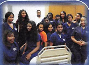
HEALTH RELATED TECHNOLOGY

Prepares students for various careers within the medical field including nursing, nursing assistant, and home health care aid.