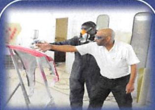
COLLISION REPAIR TECHNOLOGY

Prepares students for a career as a collision repair technician through instruction in cost estimating, painting & refinishing, metal straightening and body construction.