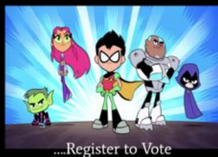
...Register to Vote