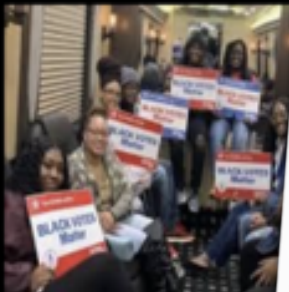
Teen Titans Lets go.....

The 14th amendment to the Constitution (1868) granted African Americans the rights of citizenship. However, this did not always translate into the ability to vote. Black voters were systematically turned away from state polling places. To combat this problem, Congress passed the Fifteenth Amendment in 1870.