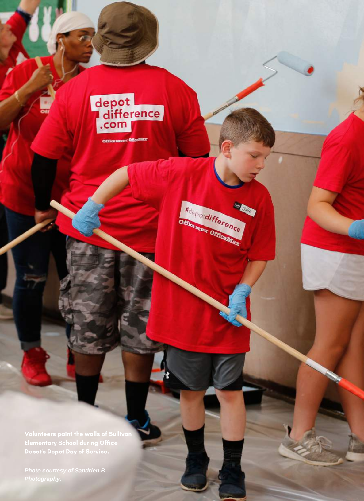
Volunteers paint the walls of Sullivan Elementary School during Office Depot's Depot Day of Service.