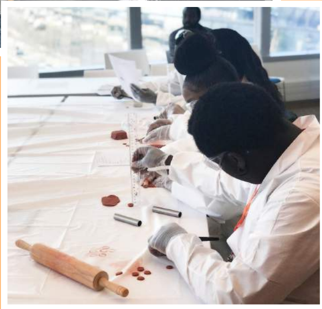
Students practiced developing medicine in a lab at GlaxoSmithKline.