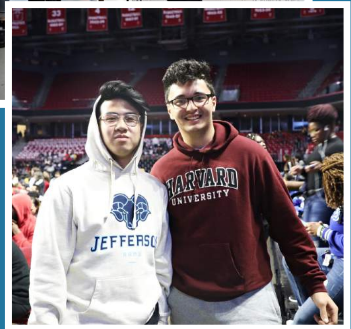
High school seniors at the Liacouras Center celebrating College Signing Day 2019.