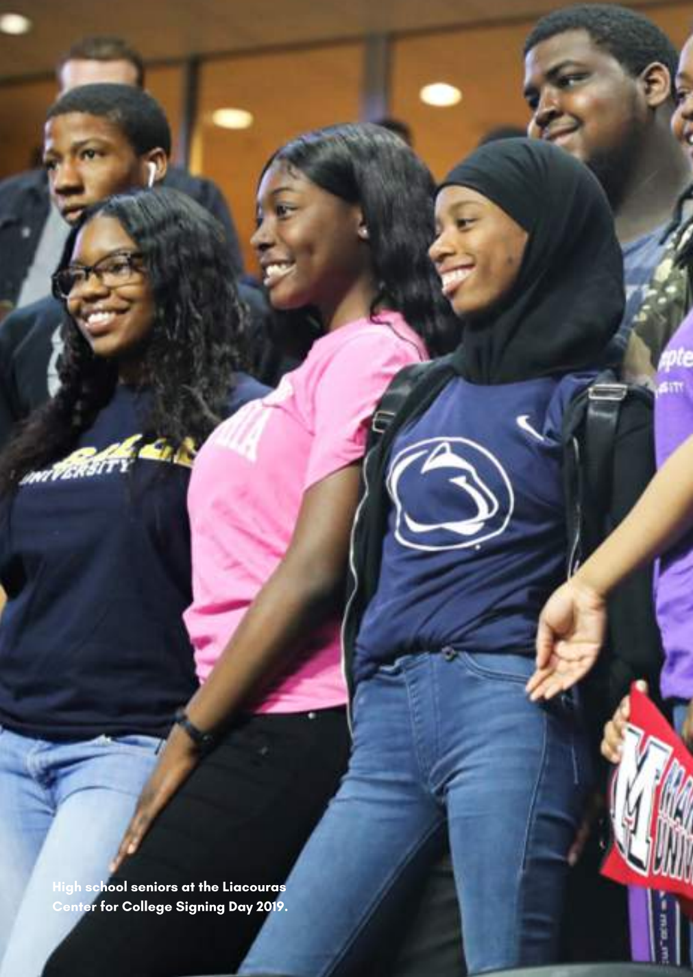
High school seniors at the Liacouras Center for College Signing Day 2019.