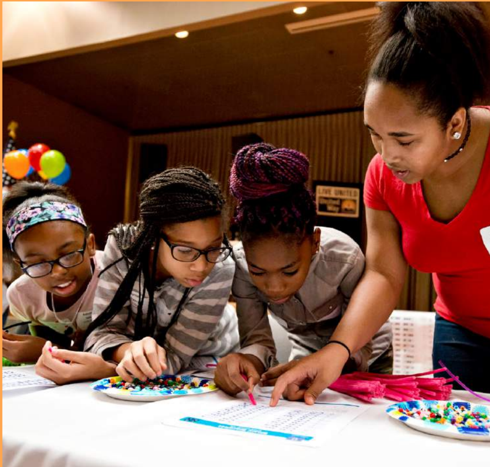
Middle school students participating in United Way's Day of Caring tabling activities in 2017.

Six years ago, the Office of Strategic Partnerships (OSP) was established to improve the way the District and schools engage with the many external organizations that offer programming and services at no cost to the District or schools. The key functions of our office are to: