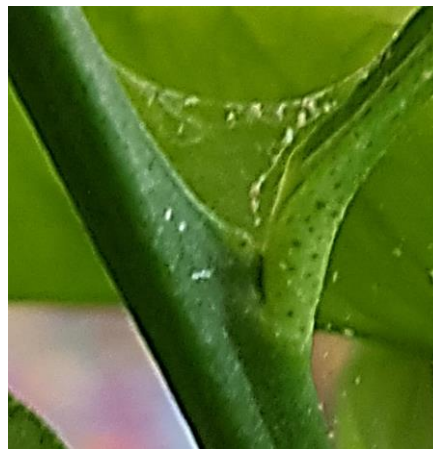
White spots are spider mites! Use a spray bottle and water to squirt them away!!