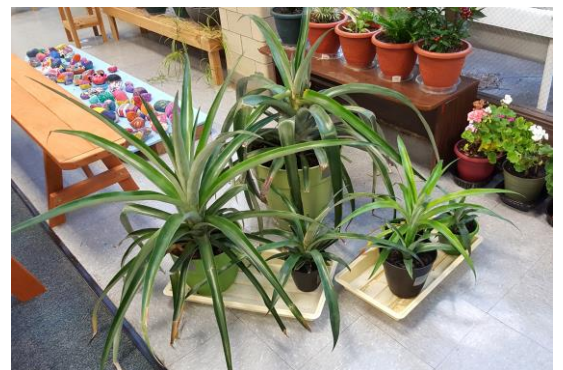
Our collection of pineapples is doing well; some of the smaller ones are actually "offspring" of the larger

The access holes (top pic) allow for cutting inside spaces and letters when creating certain patterns like the bottom image.