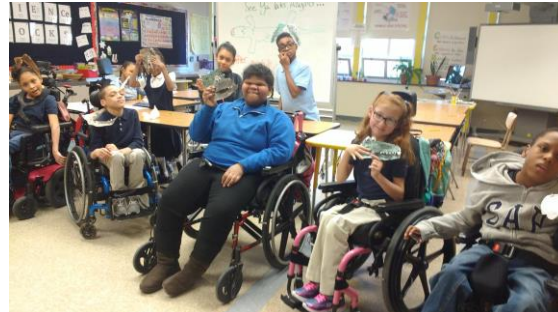
Here's the class Showing off the different snout shapes and positions of teeth of their "scary" alligators and crocodiles after our reptile lesson.