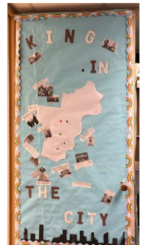
Doors are in order of 1 st , 2 nd , 3 rd —and a couple notables.